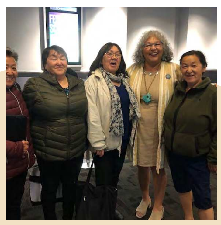
Halifax, Nova Scotia

Promoted NWAC at the Atlantic Film Festival and met women from L'nuk 101 and Atautsikut / Leaving None Behind. The documentary reveals another aspect of the true North. In their own words, the Nunavik Inuit and Cree recount their struggles and reveal how their co-ops came shining through a message of hope.