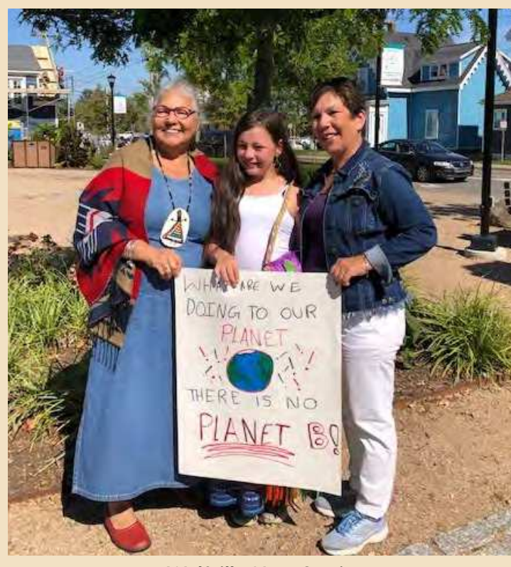
Wolfville, Nova Scotia

• Participated in a youth environmental school strike for climate change at Acadia University in Nova Scotia along with more than 150 students.