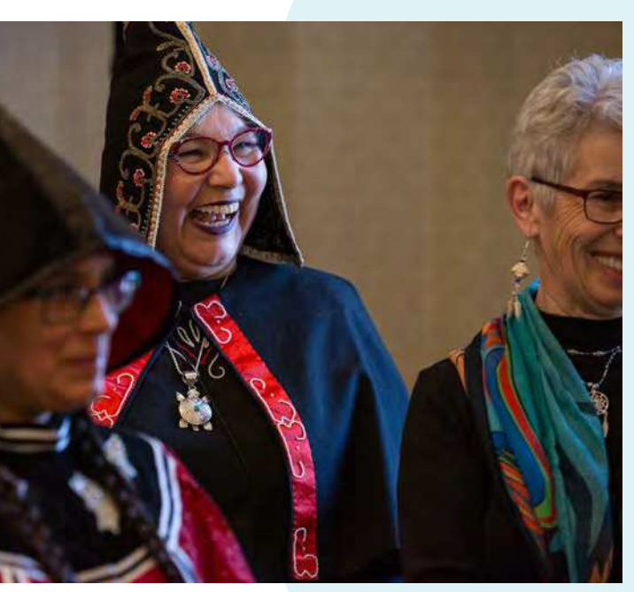
Truro, Nova Scotia