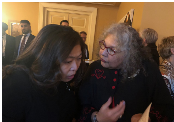
Minister Mary Ng, Minister of Small Business, Export Promotion and

On November 20, 2019, I attended the swearing in of the new Federal Cabinet Ministers at Rideau Hall in Ottawa.