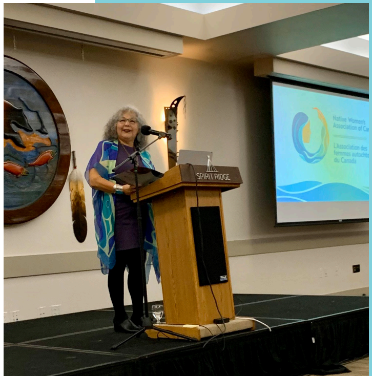
Kelowna, British Columbia