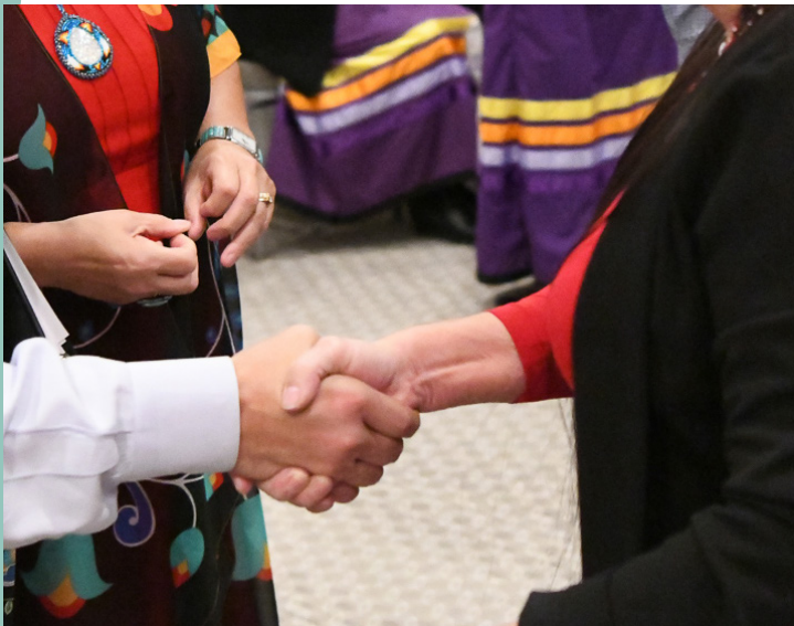
Glooscap First Nation, Nova Scotia