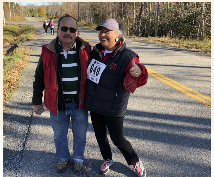
Glooscap First Nation, Nova Scotia