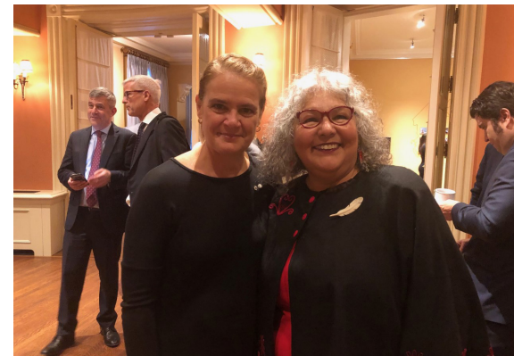
Governor General Julie Payette