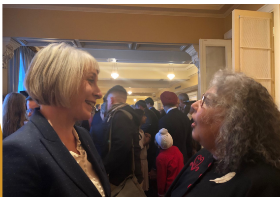
Minister of Health Patty Hajdu