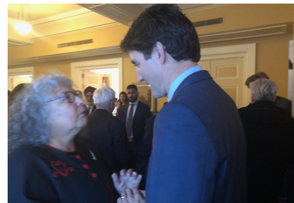
Prime Minister Justin Trudeau