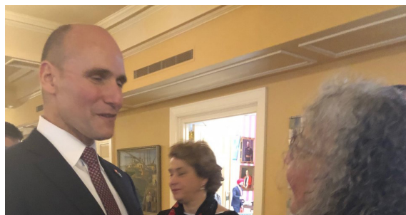
President of the Treasury Board Jean-Yves Duclos