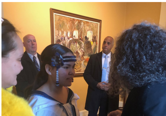
With one of the Inuit Throat Singers