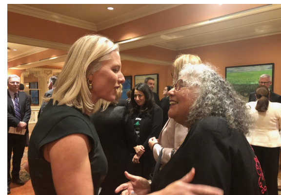
Minister of Infrastructure and Communities Catherine McKenna