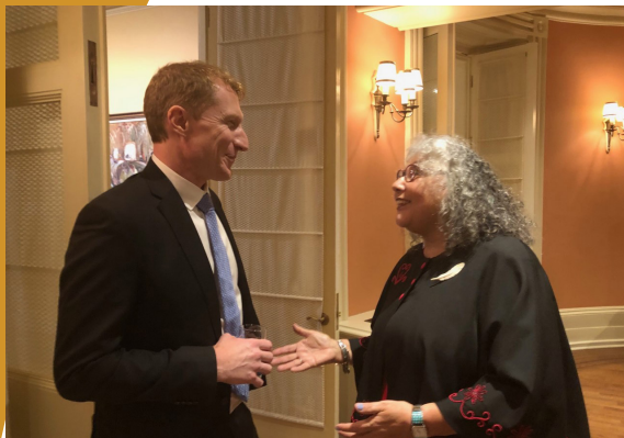
With Minister of Indigenous Services Marc Miller

On November 20, 2019, I attended the swearing in of the new Federal Cabinet Ministers at Rideau Hall in Ottawa.