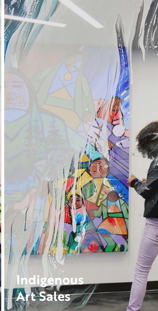
Indigenous Art Sales