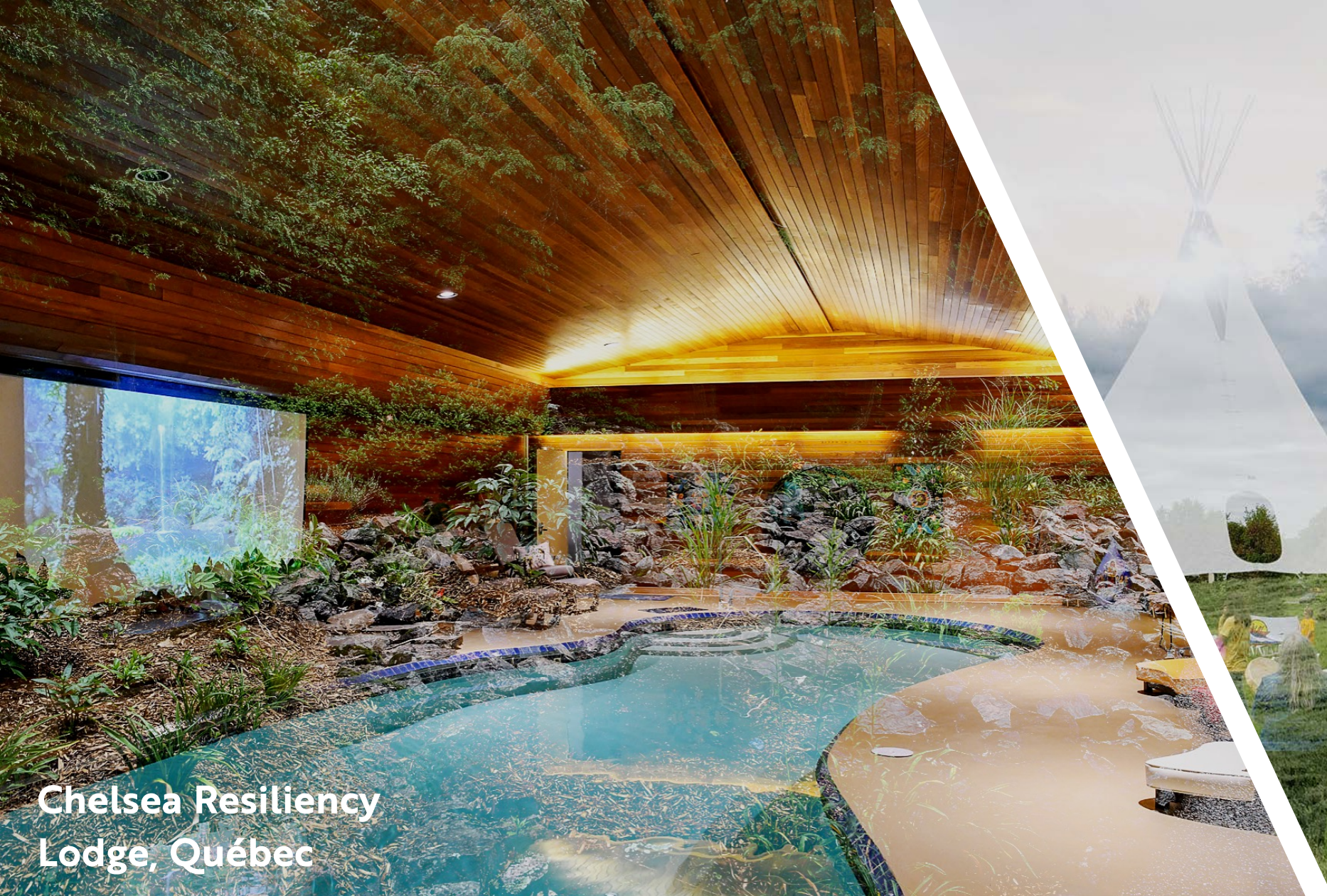
Chelsea Resiliency Lodge, Québec