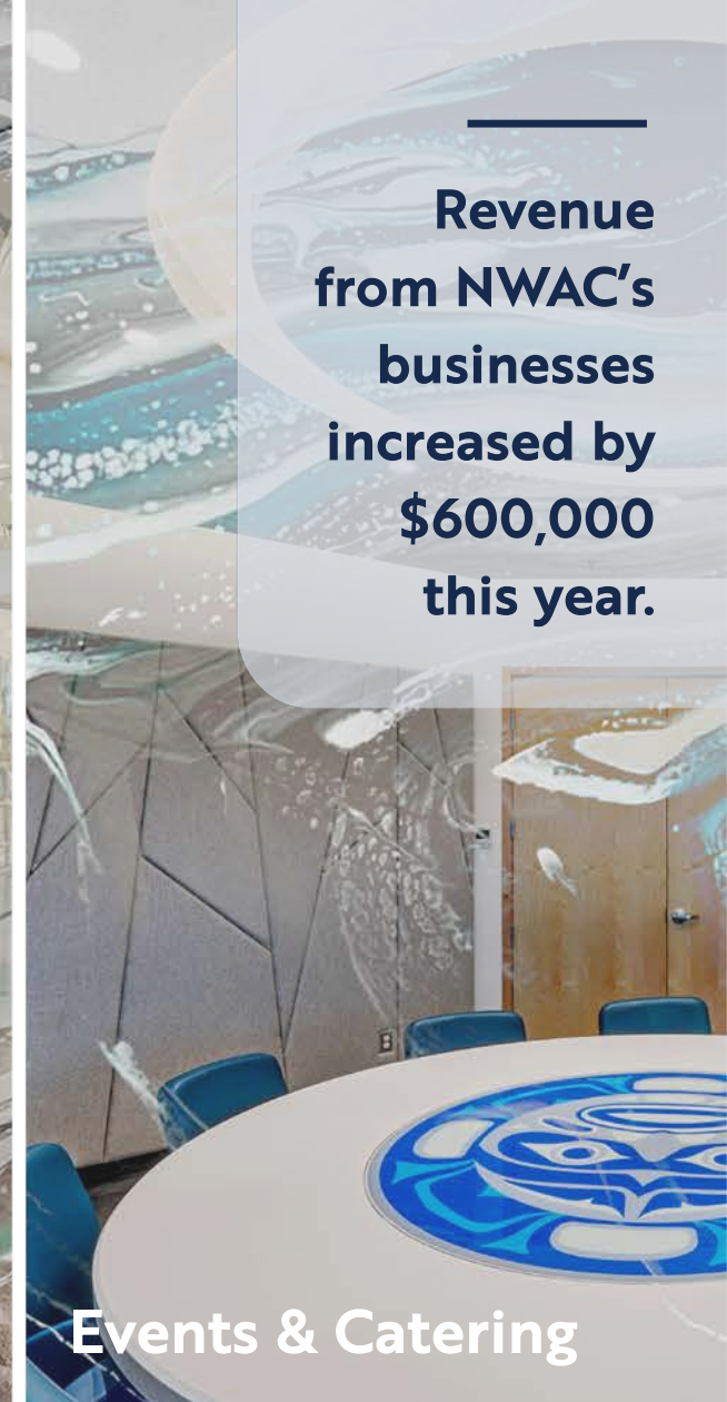
Events & Catering

Revenue from NWAC's businesses increased by $600,000 this year.