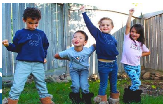
Availability of ELCC in First Nations Communities