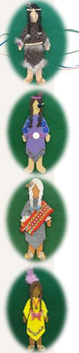
A selection of faceless dolls from the NWAC Faceless Doll Project.

Why are the dolls faceless? NWAC has chosen to make faceless dolls to reflect society's 'devaluing' of Aboriginal women and girls. The media portrays Aboriginal women as 'faceless' and Canadian society is at times indifferent to this tragedy, the lives lost and the humanity of our women. However, NWAC also feels that there is great strength and unity with the faceless dolls. Each doll is unique but their facelessness unites them as part of the same community. Although no doll has a face, together the faceless dolls have a very powerful voice and a presence that cannot be ignored.