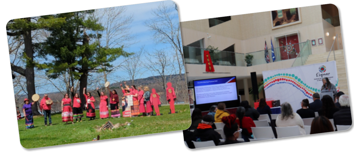
Red Dress Day, Fredericton/IWWT (May 2025).

Sisters in Spirit Event, Edmonton/IWWA (February 2025).