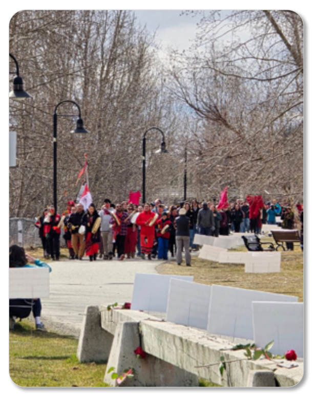
MMIWG2S+ March, Yukon/YAWC (May 2025).